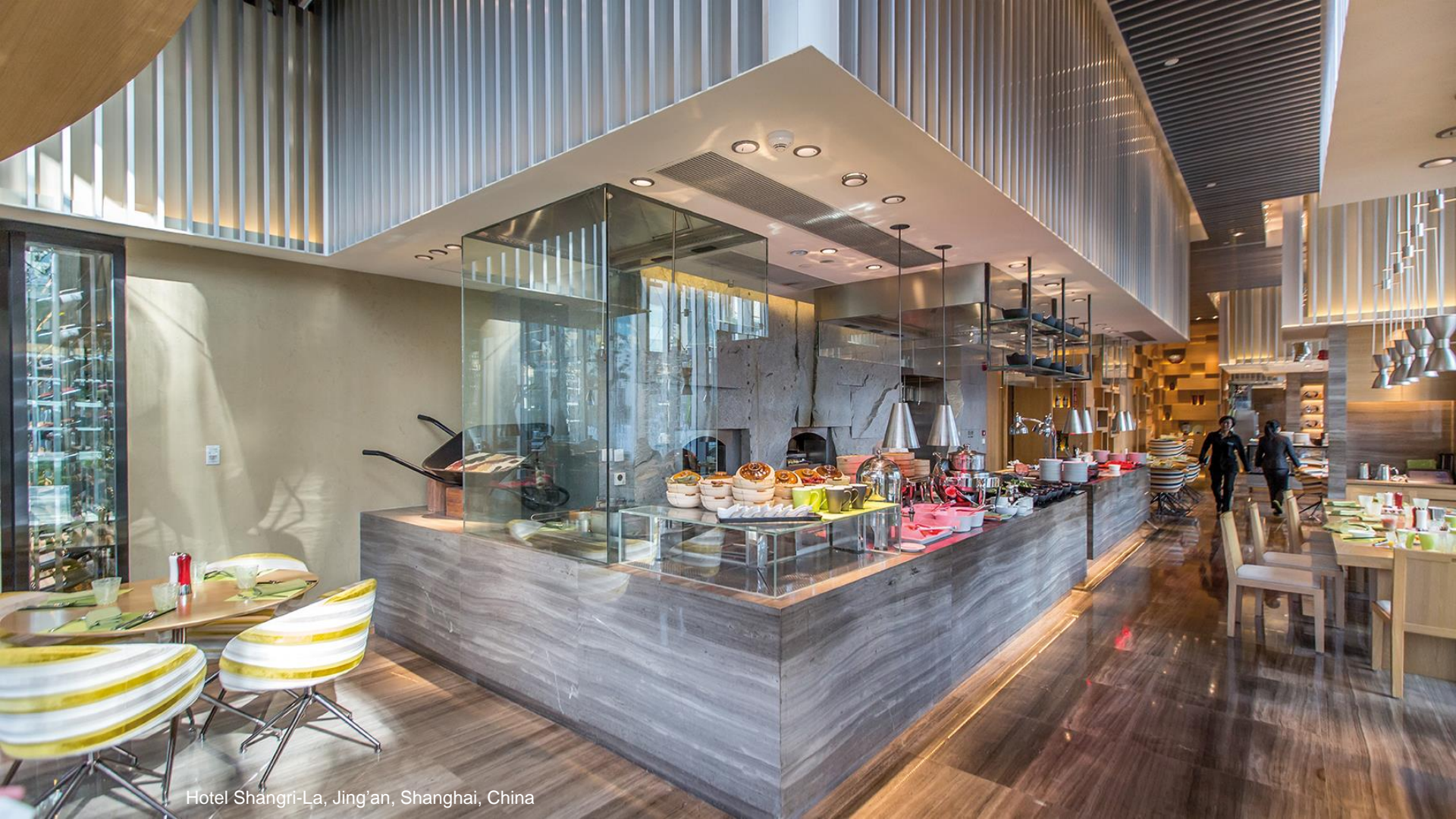
Hotel Shangri-La, Jing'an, Shanghai, China