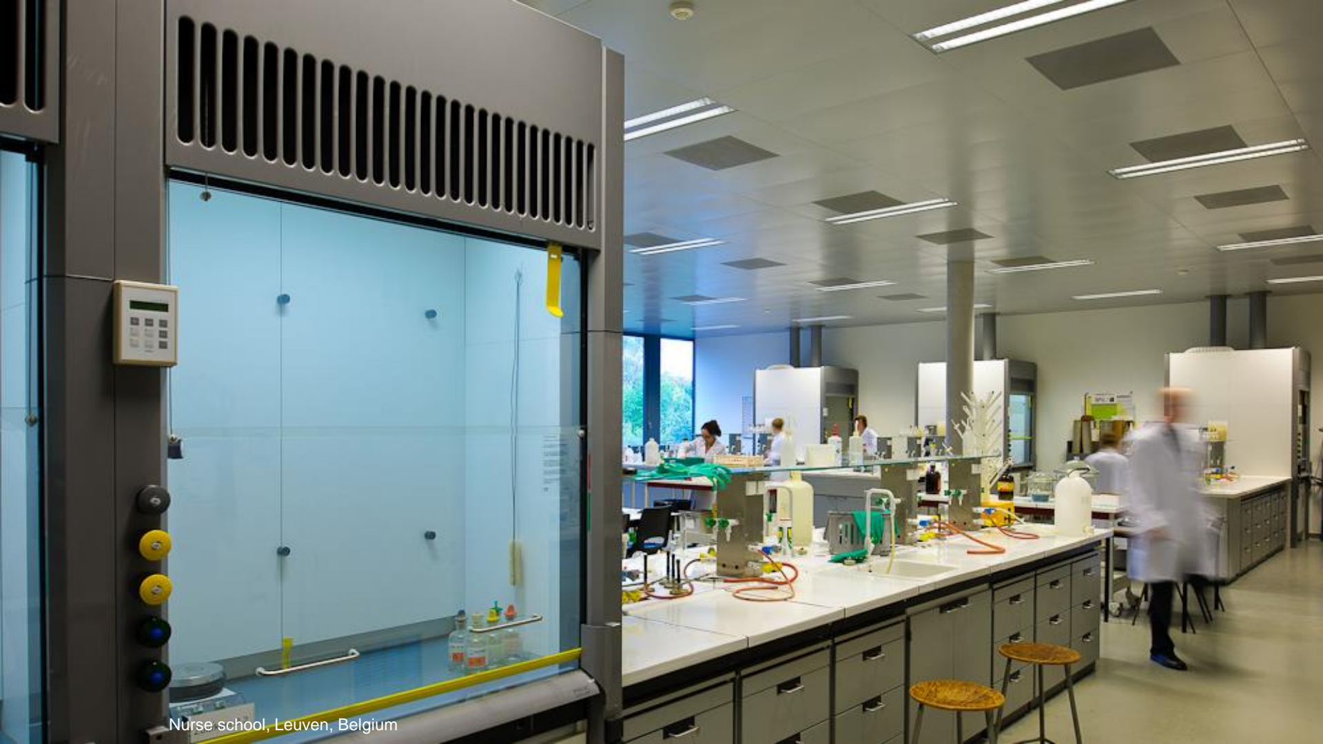
Nurse school, Leuven, Belgium