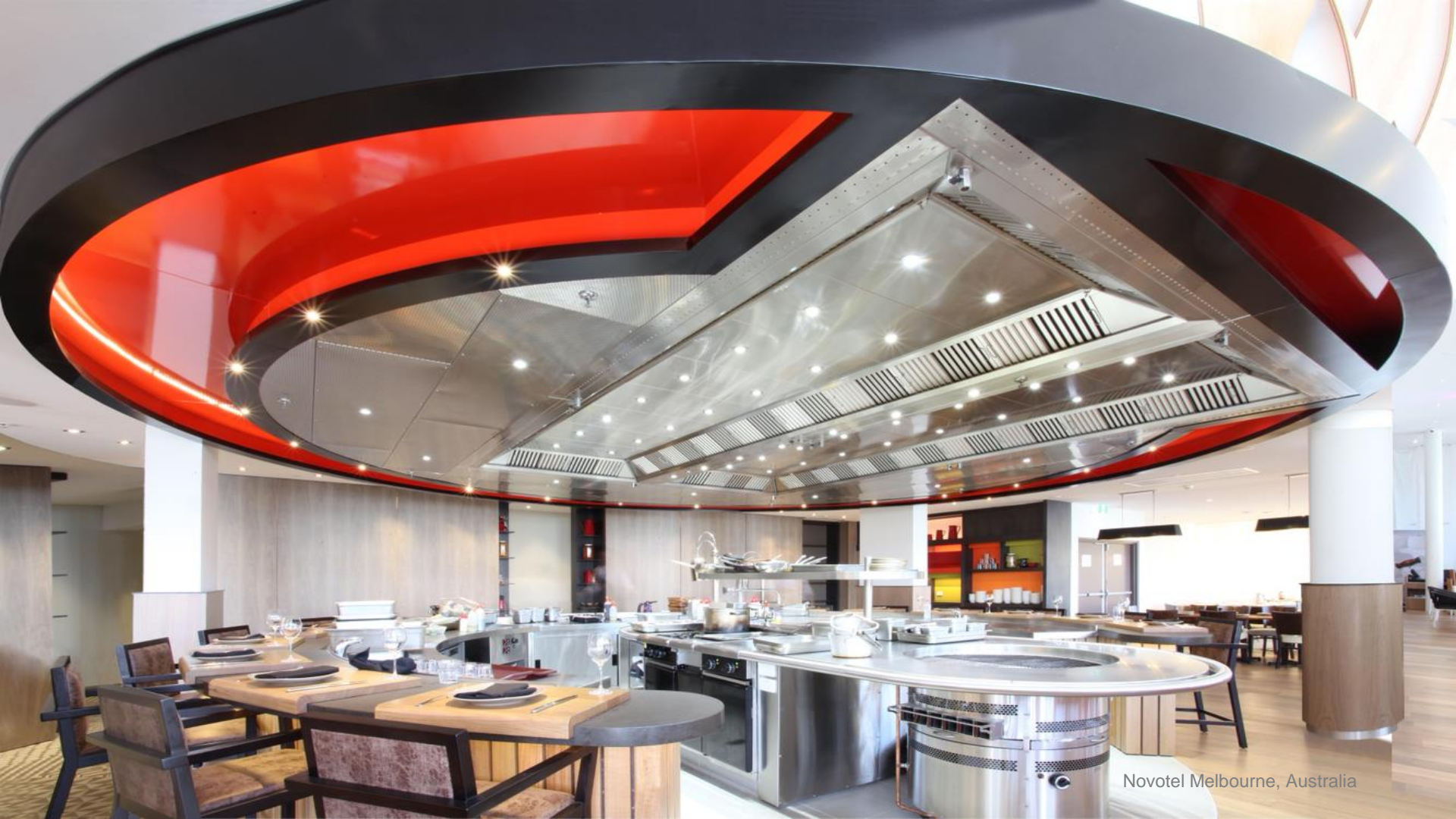
Novotel Melbourne, Australia