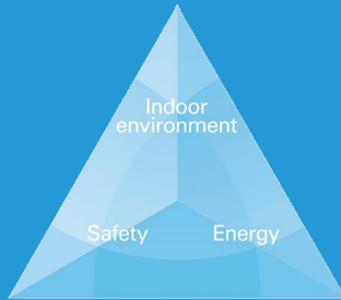
The Halton Scope

Vision to be the global value leader and first choice partner for all focus segments