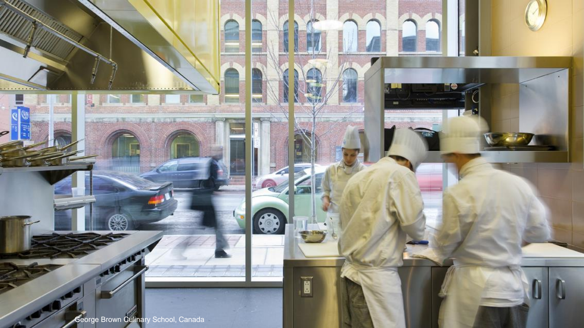
George Brown Culinary School, Canada