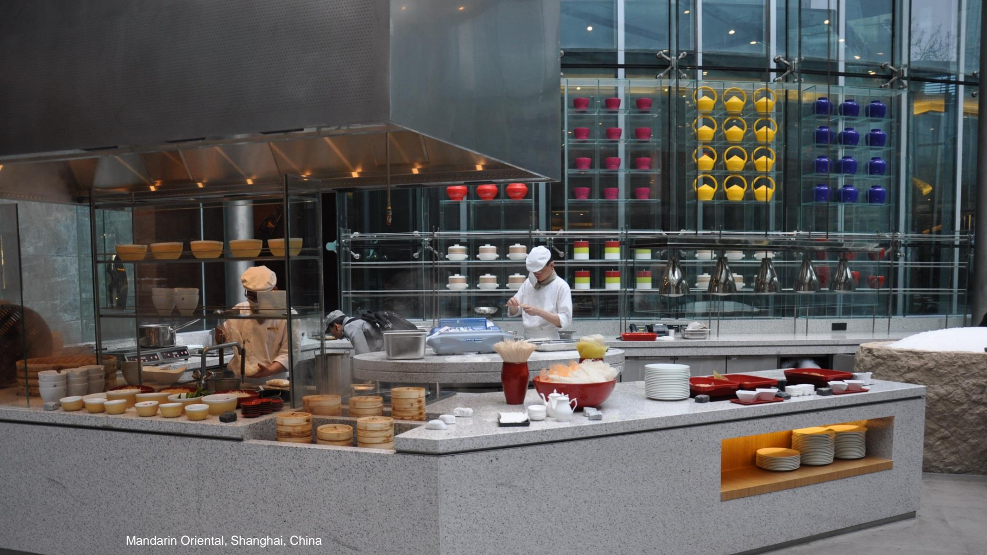
Mandarin Oriental, Shanghai, China