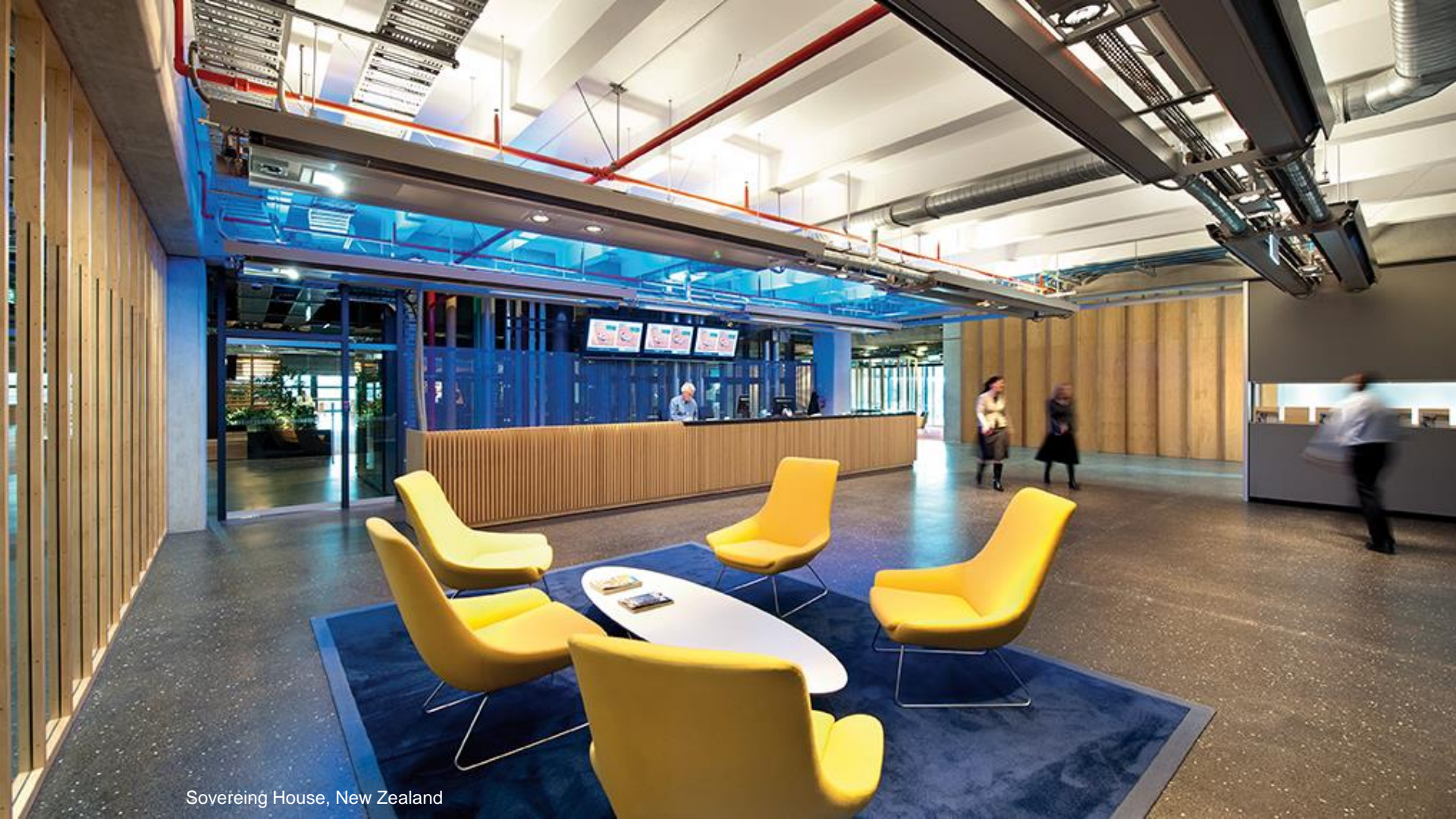
Sovereign House, New Zealand