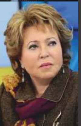
Valentina Matvienko Chairman of the Federation Council Federal Assembly of the Russian Federation

"We are intending to work actively with authorities of the Arabic countries, in order to restore our economic positions... I see real premises for keeping by Russia its leading positions in Middle East arena, where we always had many friends."