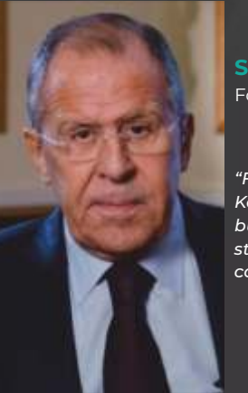
Sergey Lavrov Foreign Minister of Russia

"The summit became the authoritative platform for profes-sional and open discussion of the major economic problems. The Summit role in development of Islamic business and finance in the Russian market, strengthening of trade and economic and investment partnership, implementation of innovative projects is over the years more and more