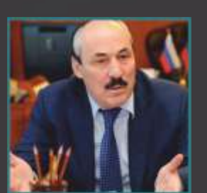
Permanent representative of the Russian Federation to the Organization of Islamic Cooperation (Russia)