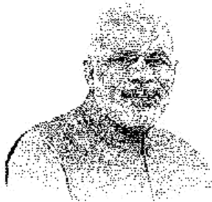
Shri Narendra Modi Hon'ble Prime Minister of India

“ For the first time in India, a challenge is being floated, in which the citizens of urban India could contribute in the formulation of development visions of their cities. Those cities which are able to competitively meet the required parameters would be developed as smart cities. This competitive mechanism would end the top-down approach and lead to people-centric urban development. ”