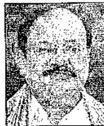
Shri M. Venkalah Naidu Hon'ble Union Minister of Urban Development, Housing and Urban Poverty Alleviation and Parliamentary Affairs

“ For the first time in India, a challenge is being floated, in which the citizens of urban India could contribute in the formulation of development visions of their cities. Those cities which are able to competitively meet the required parameters would be developed as smart cities. This competitive mechanism would end the top-down approach and lead to people-centric urban development. ”