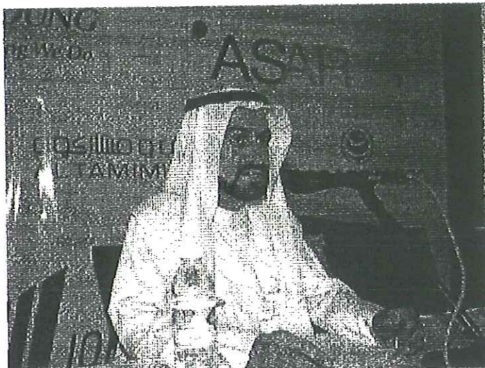
The minister of Public Works and State Minister for Planning and Development Dr. Fadhil Safar speaking during a conference held Monday, March 26, 2012.

He added that the perspective of the development plans is based on the vision as produced by His Highness the Amir Sheikh Jaber Al-Ahmad Al-Sabah which focuses completely on short as well as long term plans and objectives. Minister Safar said